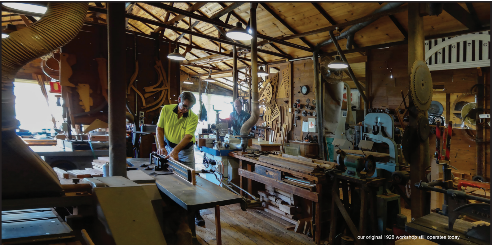
our original 1928 workshop still operates today